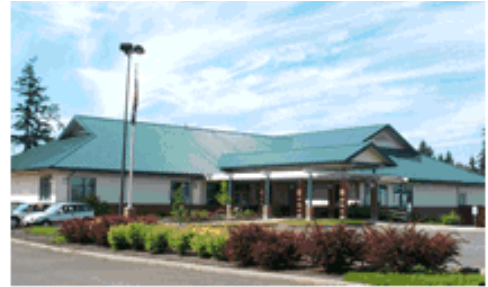
Clark Regional Wastewater District 8000 NE 52nd Court